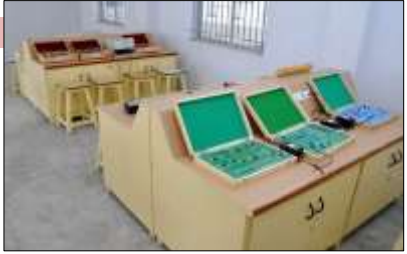
Laboratory Details / Electronics Circuits Lab